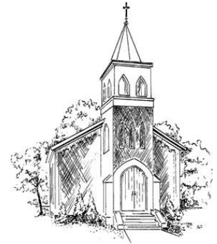
St. Stanislaus, Chatsworth Sunday 9:00 am