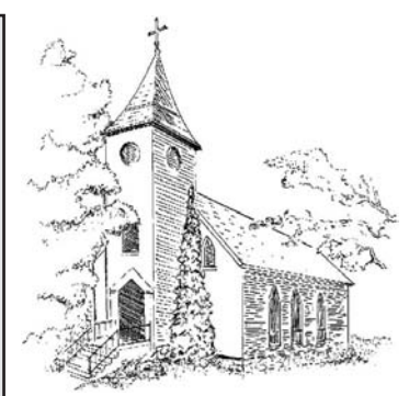
St. Mary of the Rosary, Hepworth Sunday 9:00 am (Nov-Mar)

Email: stmaryowensound@hamiltondiocese.com www.stmarysandthemissions.ca